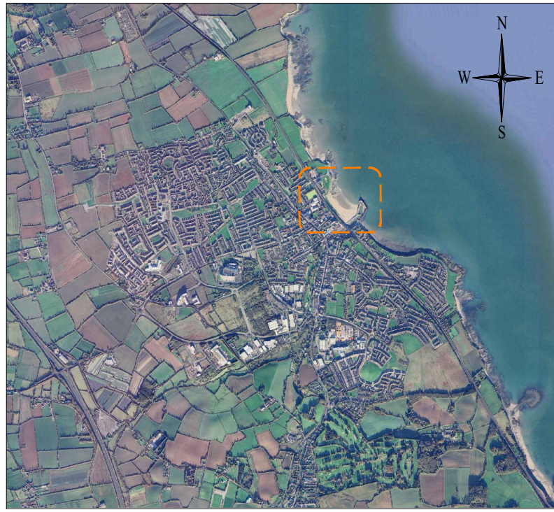
LOCATION PLAN 1:50,000