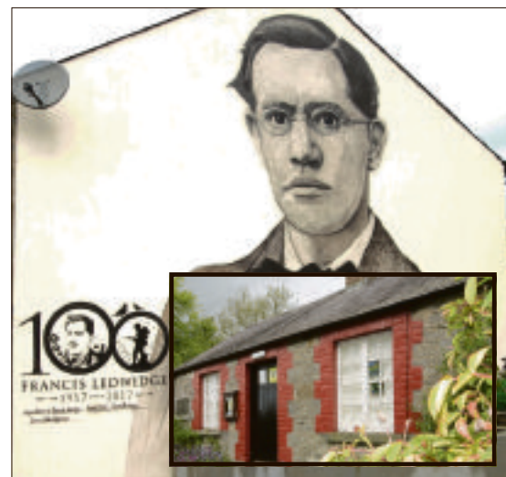
The Ledwidge mural in Slane and (inset) the museum.

The museum received a €1,000 arts grant from Meath County Council Arts Office following a successful applica-