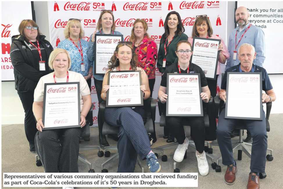
Representatives of various community organisations that received funding as part of Coca-Cola's celebrations of its 50 years in Drogheda.

Coca-Cola is celebrating 50 years in Drogheda and presented €50,000 in donations to community organisations from a special fund established last year to celebrate its long connection with communities in the locality.